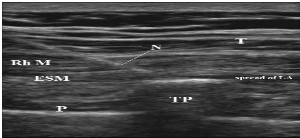
Figure 2: Sono-Anatomy Showing the Inline Technique for Erector Spinae Plane Block. Shows the Sonoanatomy, T= Trapezius, N=Needle, Rhm= Rhomboid Muscle, TP=Transverse Process and P=Plane (Myofascial Plane between Transverse Process